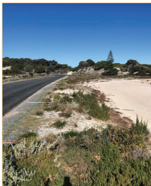
LAKE HERSCHEL BEFORE REVEGETATION