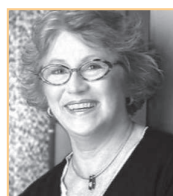
Janet Holmes à Court, AC