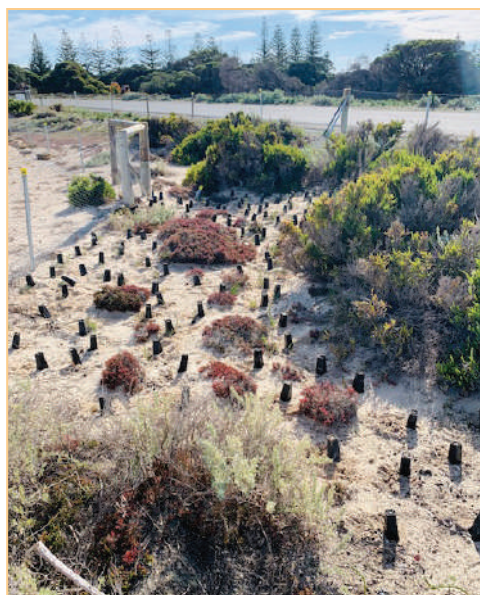
LAKE HERSCHEL AFTER REVEGETATION