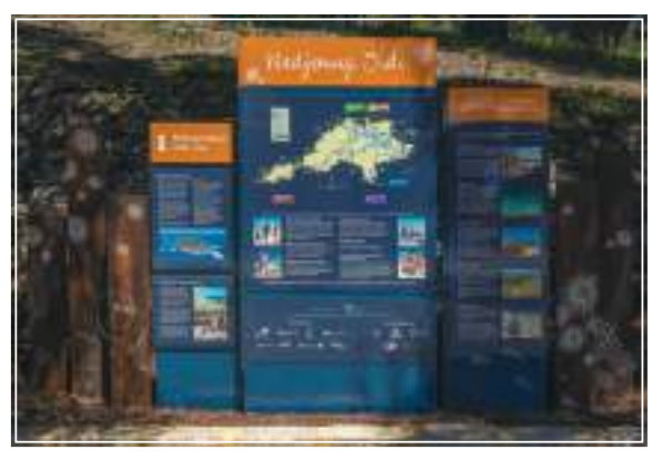
WADJEMUP BIDI TRAIL HEAD, THOMSON BAY SETTLEMENT

The Rottnest Foundation is proud to be a major partner in the development of the Wadjemup Bidi. The 45km walk trail, made up of five sections, is an important environmental initiative to manage visitor impact on the fragile environment, whilst offering a new recreational experience for visitors.