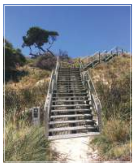
GABBI KARNINY BIDI – DISCOVER THE SALT LAKES 9.7KM LOOP